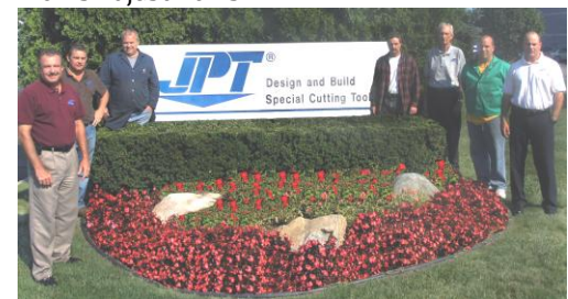
JPT Velocity Team

"It's like breathing. You don't even have to think about it. After a while you do it and it works. It just flows."