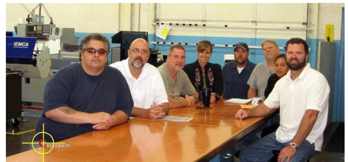
Criterion Tool's Velocity Team

“I kept saying that we’re going to get there, and we did.” And 3 years later, they’re maintaining it!