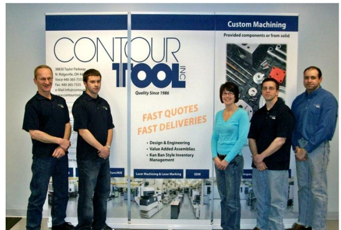
The Contour VELOCITY Team